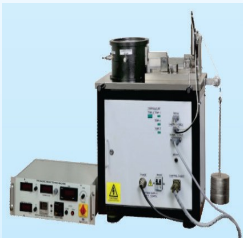
Pin-on-Disc Friction and Wear Test Rig