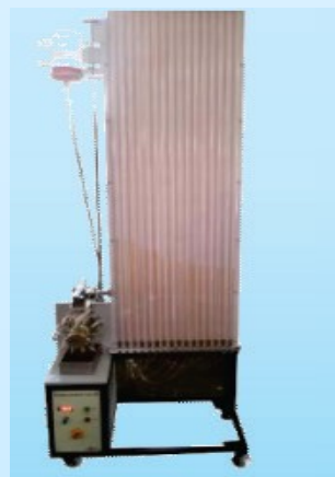
Journal Bearing Test Rig