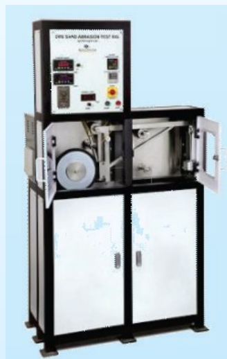
Dry Sand Abrasion Test Rig