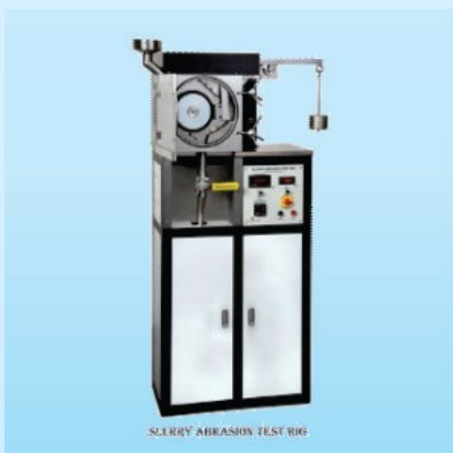
Slurry Abrasion Test Rig