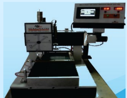
Two-Body Abrasion Test Rig