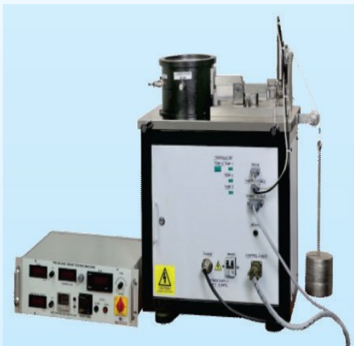
Pin-on-Disc Friction and Wear Test Rig