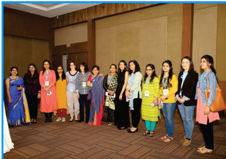
A group of female delegates added colour to the dinner program on the third day