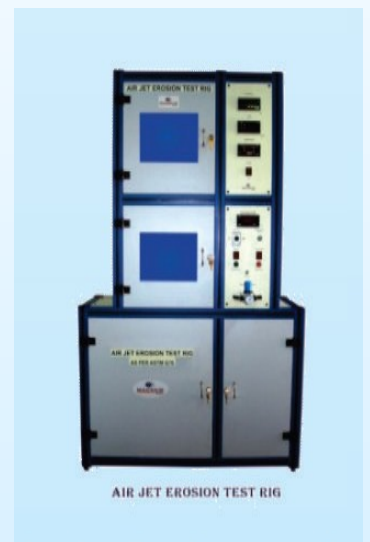
Air Jet Erosion Test Rig