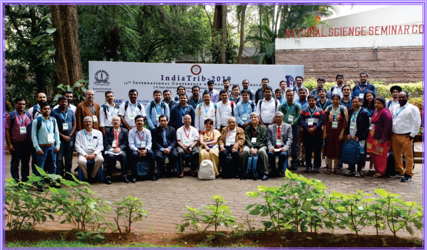
Group photo of the participants during the Pre-conference Education Course