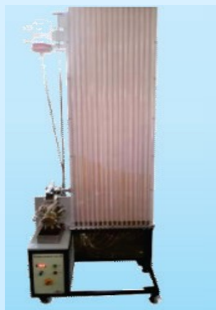
Journal Bearing Test Rig