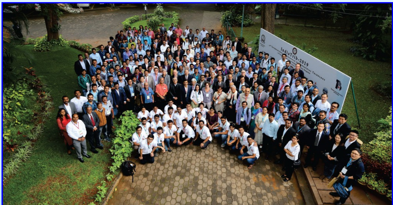
A group photo of all participants of IndiaTrib 2019 taken immediately after the inaugural function on 2 nd Day of the event.